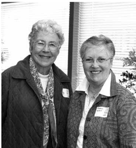
Serving 20 Years