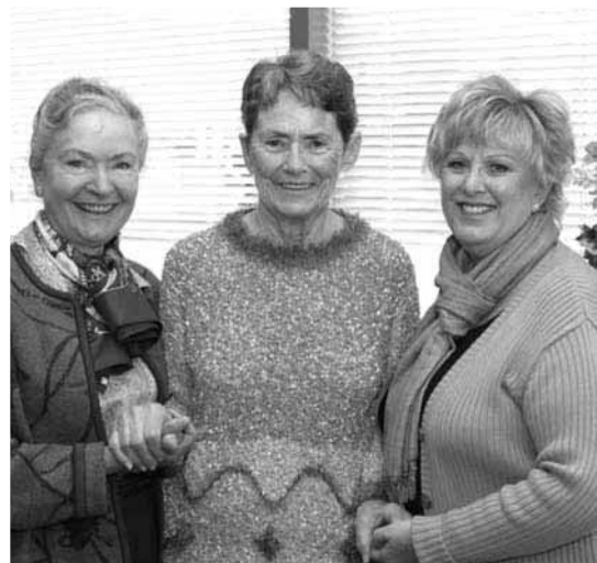
Serving 15 Years