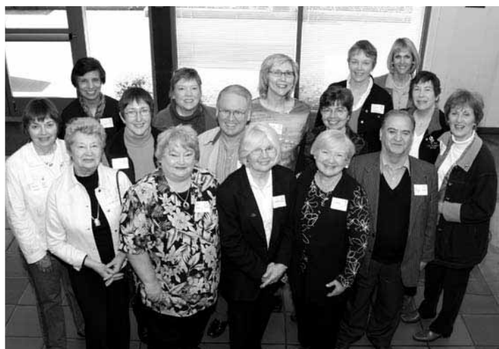
Serving 5 Years