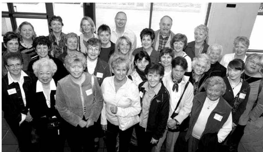
Serving 10 Years