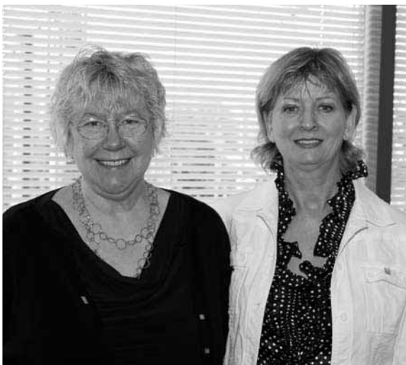
Serving 25 Years