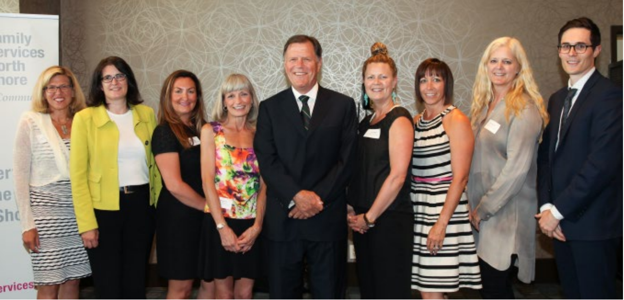
Our 2016/2017 Board of Directors

All that we have done this year and our work to prepare for the next five years is a result of the generous support of our donors, funders, and volunteers. On behalf of our Board of Directors and Staff, we thank you for your sustaining commitment to Family Services of the North Shore.