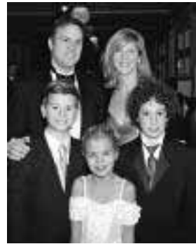
The Lunter family