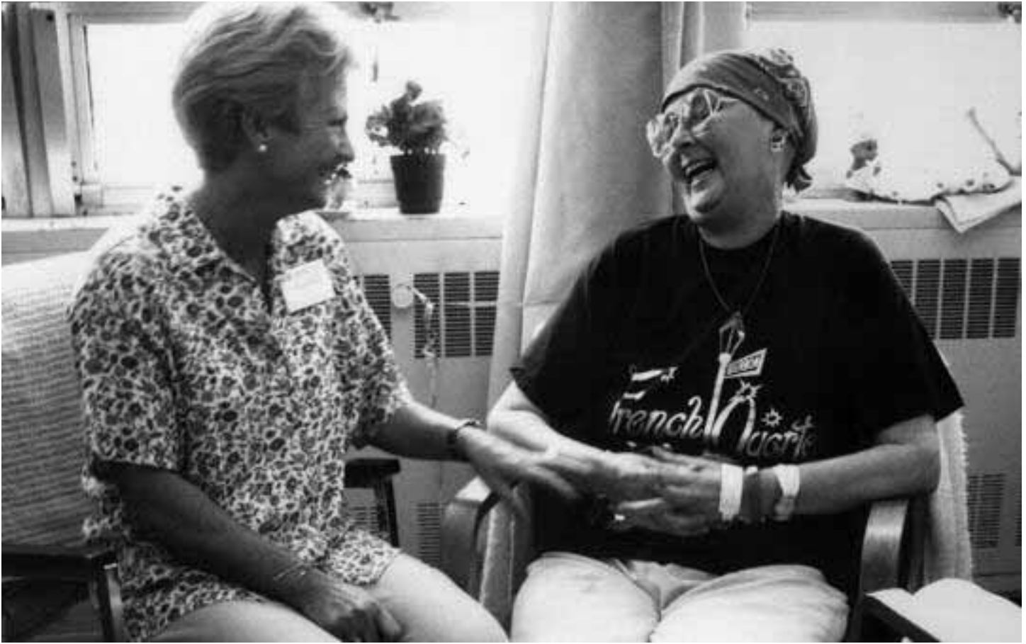
Palliative Care Volunteer at work

“We are so blessed to have these wonderful volunteers sharing their time and gifts with our patients.”